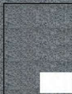
1/8 Page (H) 3.875" x 2.45"