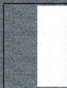
1/2 Page (V) 3.875" x 10.5"