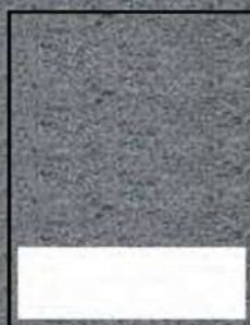
1/4 Page (H) 8" x 2.45"