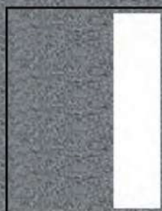
1/3 Page (V) 2.5" x 10.5"