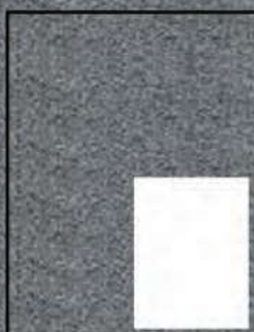
1/4 Page (V) 3.875" x 5.125"