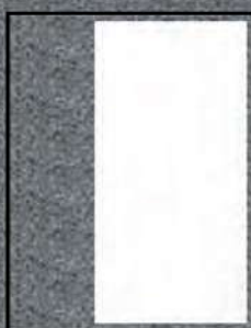
2/3 Page (V) 5.25" x 10.5"