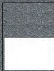
1/2 Page (H) 8" x 5.125"