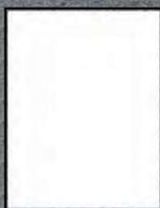
Full Page 8.5" x 11" - Bleed 8" x 10.5" - No Bleed